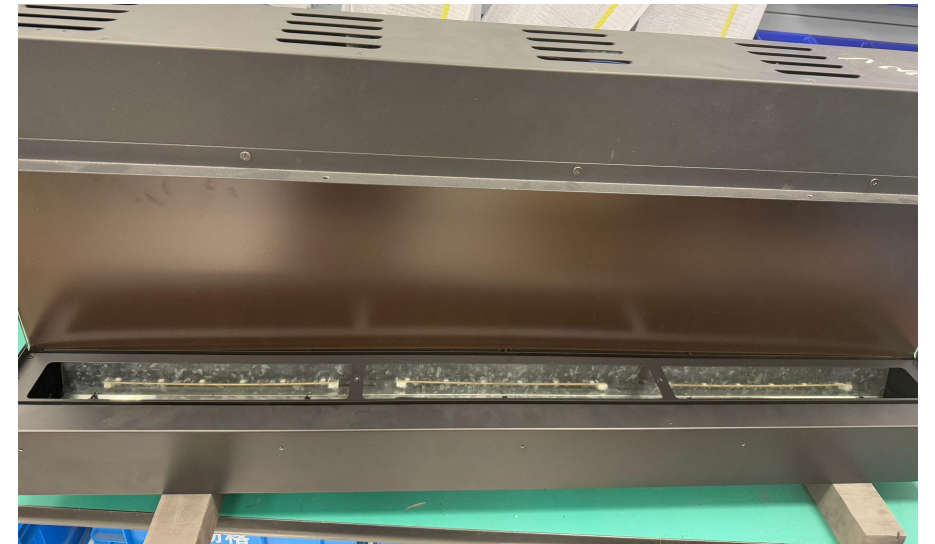
Photo after removing the plastic try.