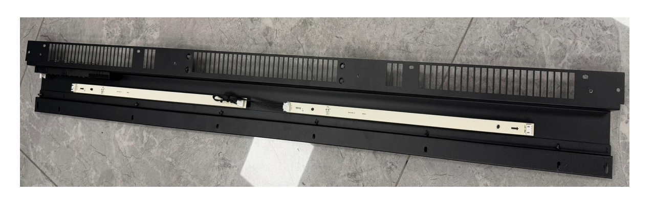
The air outlet panel.